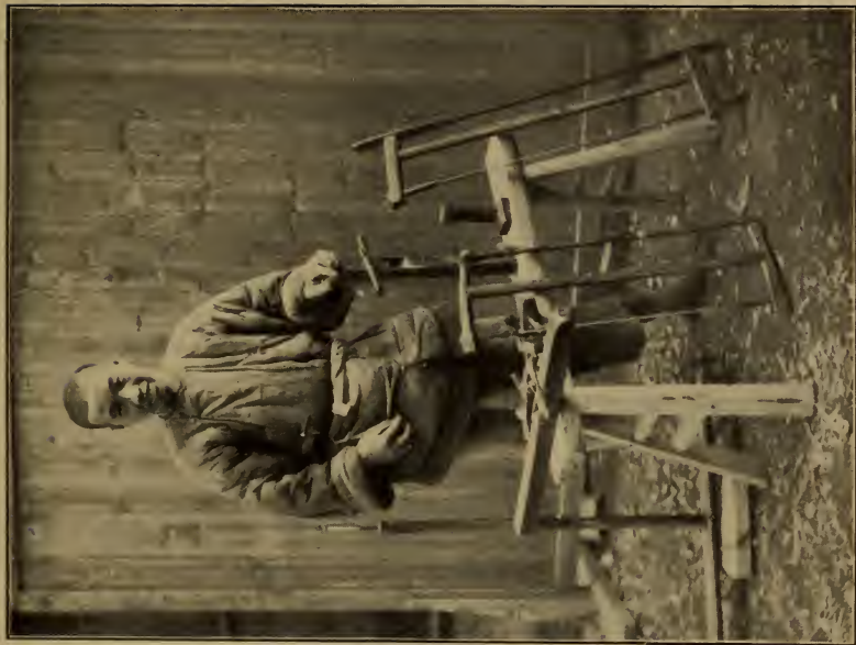
ONE OF HER SOURCES OF STRENGTH—A CARPENTER.